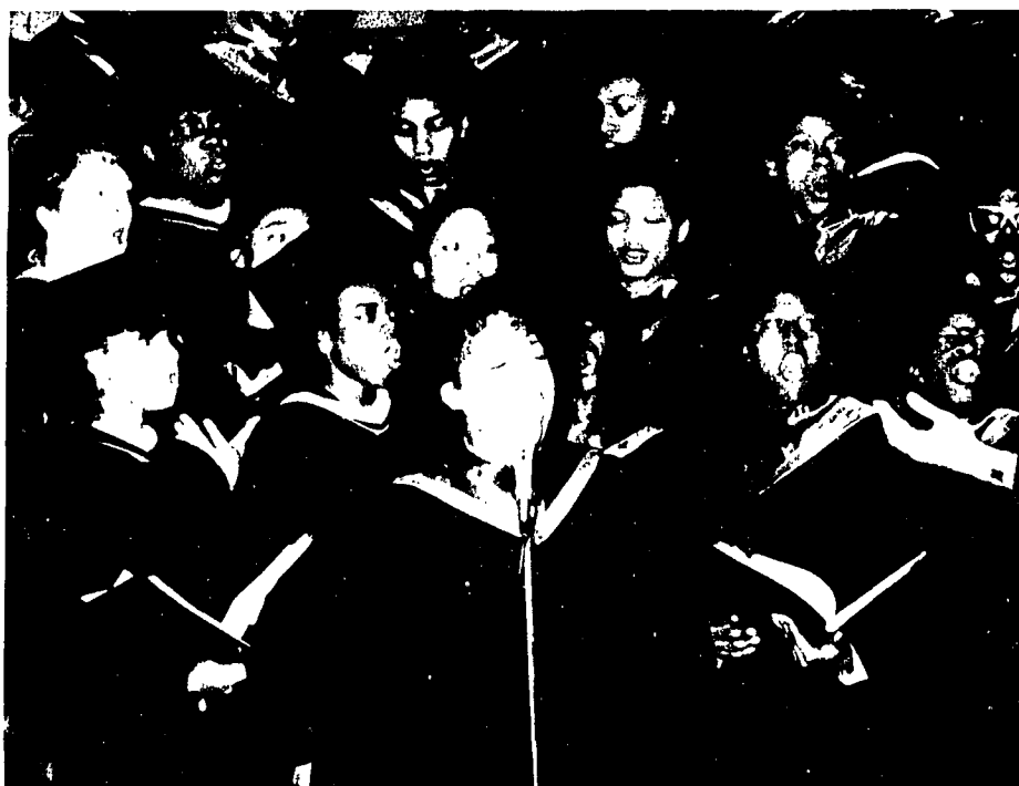
The Lincoln University Concert Choir

The Philadelphia Alumni Chapter recently sponsored a performance of the Lincoln University Concert Choir at the Berean United Presbyterian Church, Broad and Diamond Streets, Philadelphia. The program included a segment of "Music of African Americans."