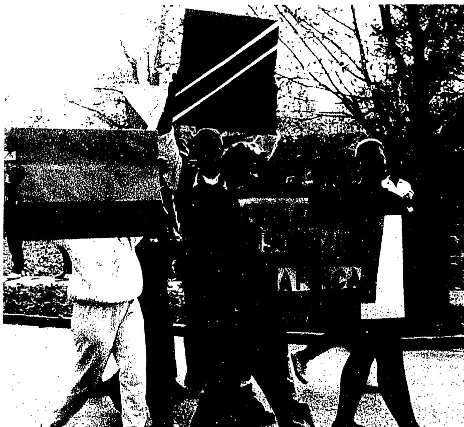
The Homecoming Parade featured floats by many campus organizations, including the International Club which placed third in the float competition.