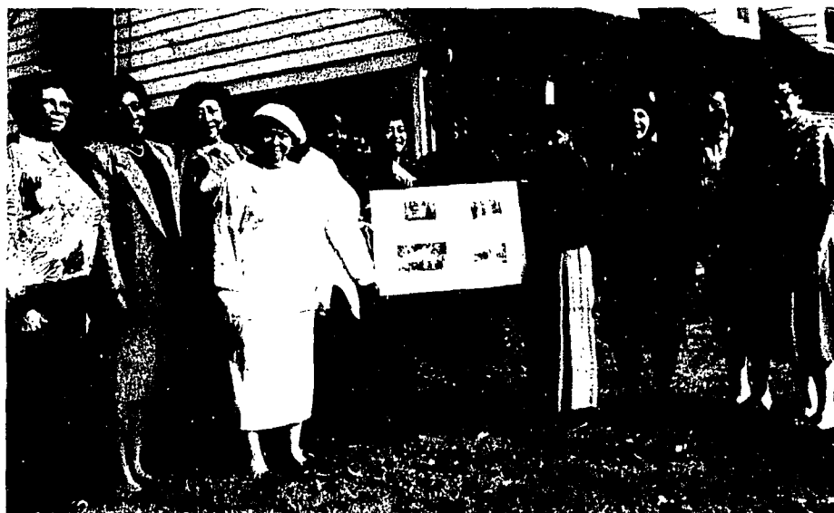
Members of Zeta Phi Beta presented the Ladies Auxiliary with historic photographs of Alumni House as part of the Homecoming Day festivities.